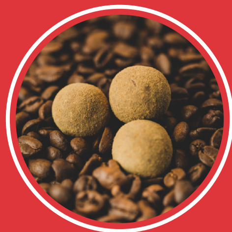
CONCEPT PHOTO FROM THE LAKRIDS PROJECT