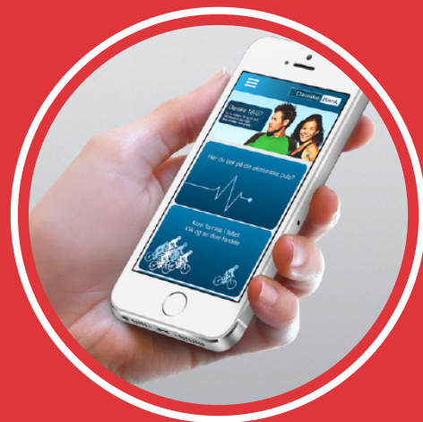
CAMPAIGN SOLUTION FOR DANSKE BANK